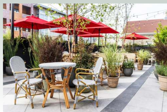
Etta, 1840 W. North Ave., Chicago, IL