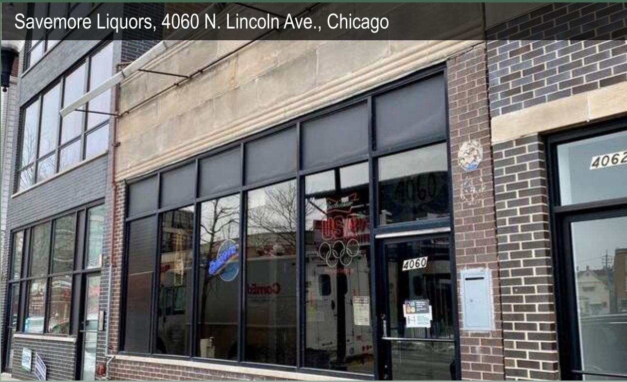
Savemore Liquors, 4060 N. Lincoln Ave., Chicago

1629 North Halsted Street, Floor 1 Chicago, Illinois 60614 kudangroup.com