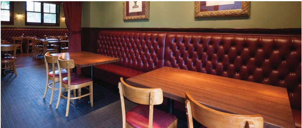
Club Room / Back Dining Room