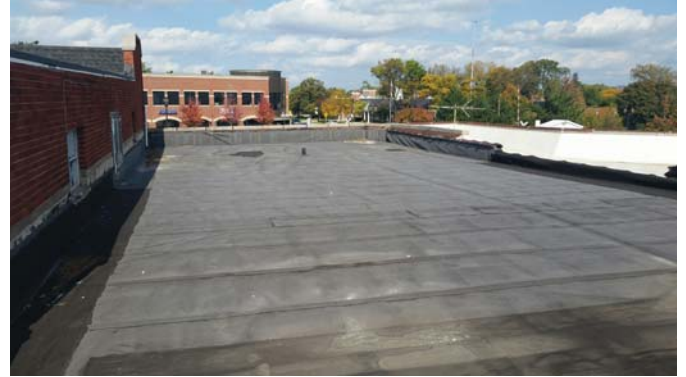
Rooftop View North