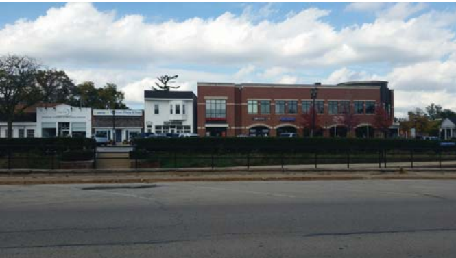
Metra Station in Front and Retail Access