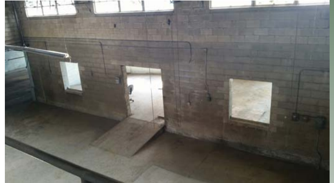
Main Room View from Loft