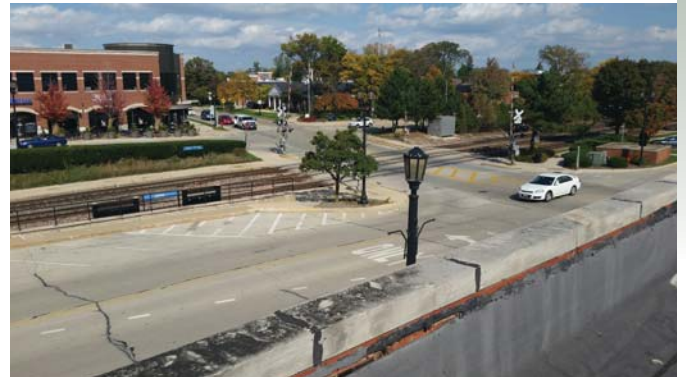
Rooftop View of Front Street