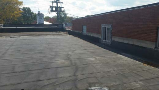
Rooftop View South