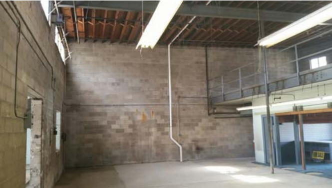
Main Room Facing West and Loft