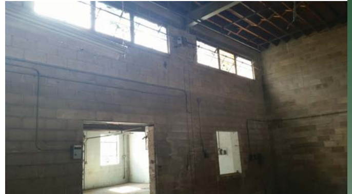
Main Room Facing South and Windows