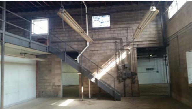
Main Room Facing East