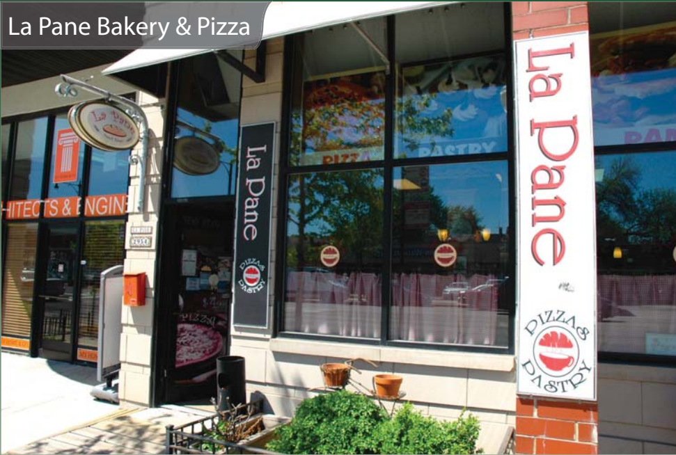
La Pane Bakery & Pizza

156 North Jefferson St. Chicago, Illinois 60661-1411 kudangroup.com